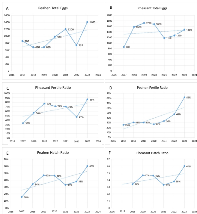
Figure 3: Year-Wise Comparison of Peafowl and Pheasant's Total Eggs, Hatchability, And Fertility Ratio