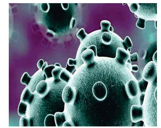
Figure 1: Monkeypox virus structure

Global migration creates new infectious disease risks. Stronger forceful action is needed, yet repeated requests go unmet. The monkeypox virus (seen in figure 1) is what causes monkeypox, a rare zoonotic disease [1, 2]. Monkeypox and smallpox viruses are connected. In the past, it was discovered that smallpox immunization with the vaccinia virus provided about 85% protection against monkeypox [3]. Routine immunization against smallpox was no longer recommended after it was eradicated in 1980, and an orthopoxvirus vaccine program has not been launched in nearly 40 years [4].