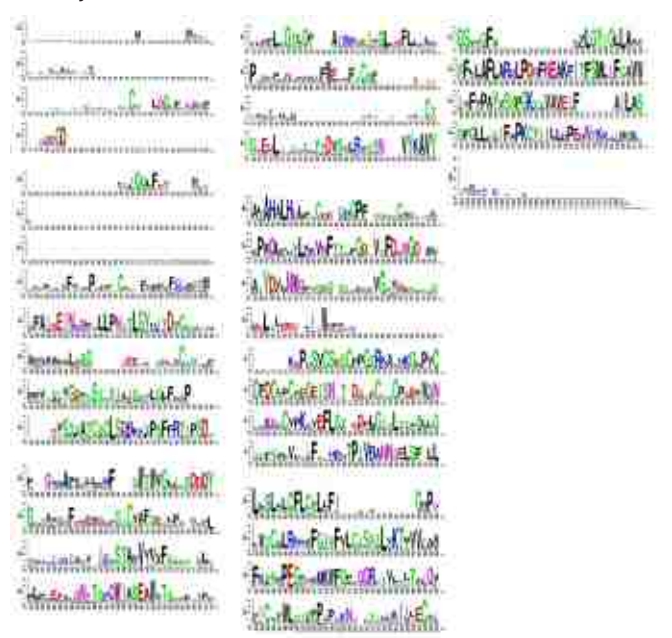
Figure 3: Generation of sequence Logo for V2R gene family in Danio rerio

Figure 3 shows generation of sequence Logo for V2R gene family in Danio rerio generated by Weblogo that shows highly conserved amino acid sequences in this family indicative of its conservation throughout evolution and history.